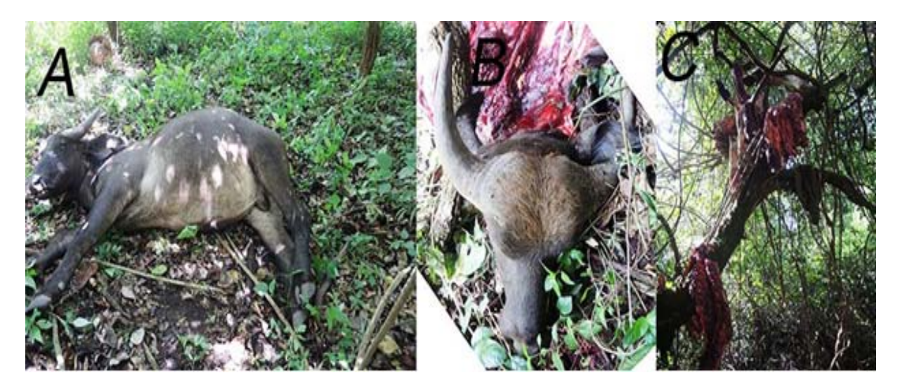
Figure 2. Poached and butchered unidentified subspecies of buffalo ( S. caffer ) on the bank of the Dabena River (tributary of the Didessa River), upper catchment of the Blue Nile (April 18, 2014). A= younger buffalo; B= older buffalo; C=butchered and carefully arranged for transport (Photo: Habte J. Debella). Poached and butchered unidentified subspecies of buffalo ( S. caffer ) on the bank of the Dabena River (tributary of the Didessa River), upper catchment of the Blue Nile (April 18, 2014). A= younger buffalo; B= older buffalo; C=butchered and carefully arranged for transport (Photo: Habte J. Debella).