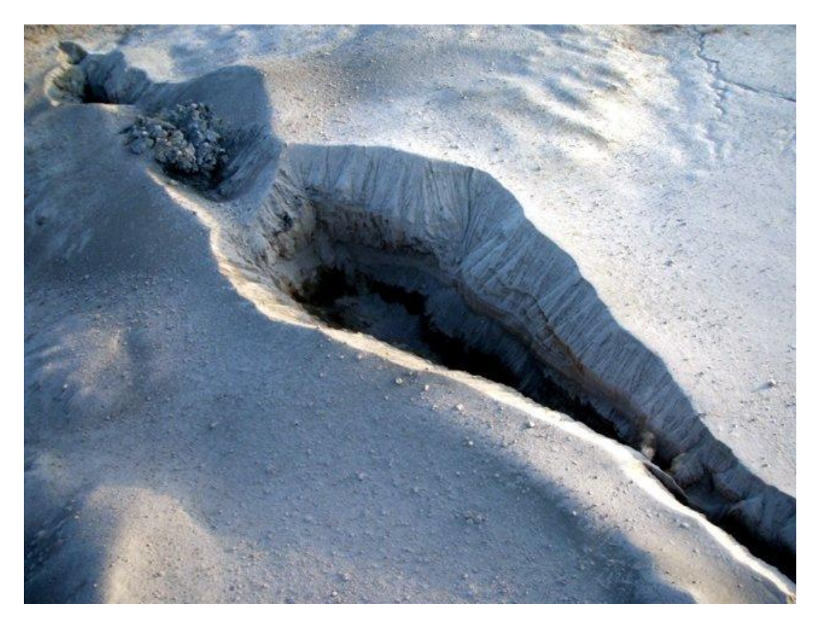
Figure 3. An aerial view of the fissure vent at Da'Ure (Dabbahu), showing the post-eruptive extensive ash fallouts, pumice dome and fissure vent.