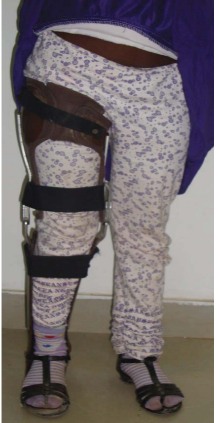
Figure (2): The same patient using the Ischeal Weight Bearing Calliper.

In our series a painless limp was the presenting symptom for 88% of patients, similar to what was reported by Kaggs<sup>5</sup>.