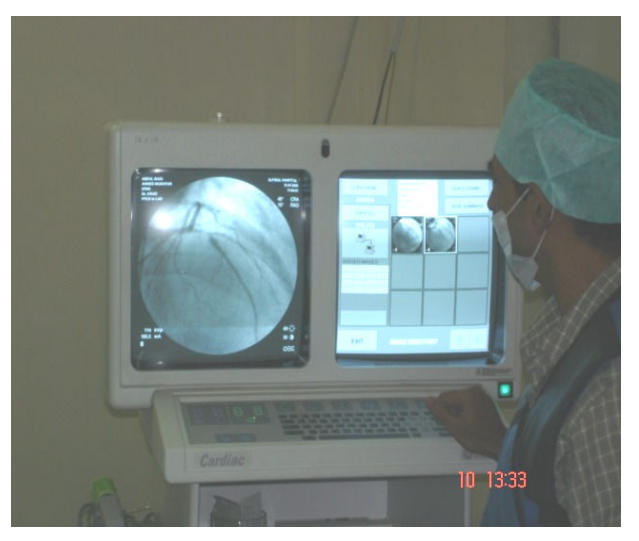
Al-Faisal specialized Hospital; an important new addition to modern medical services in Sudan. Physiotherapy, Cath.Lab., emergency and ICU services are available