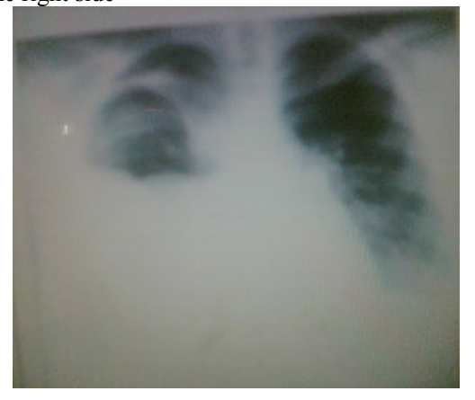
Fig 1: Bilateral pleural effusion more marked in the right side

During surgery a solid irregular right ovarian mass was found, with large amount of free fluid in the peritoneal cavity, but no evidence of infiltration of the adjacent organs, liver or peritoneal metastasis. Sample of the ascetic fluid was taken for cytology and the rest of the fluid was sucked out. The mass was resected and sent for histopathology (Fig 2).