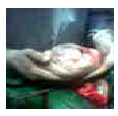
Fig 2: Right overian mass more than triple the hand fist in size.

The postoperative period was uneventful. The patient was discharged home and followed in the out patient department. The pleural effusion and ascites subsided and disappeared in four weeks time (Fig 3).