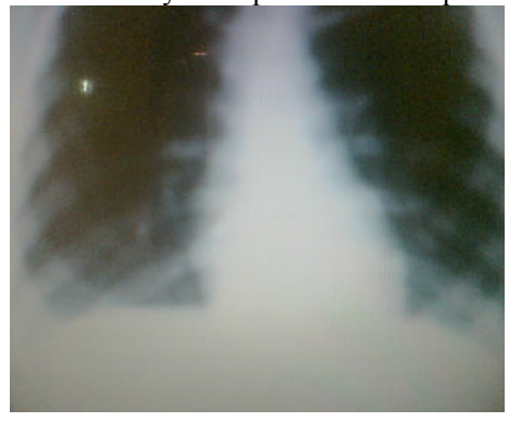
Fig 3: Chest X-ray at outpatient follow up

The postoperative period was uneventful. The patient was discharged home and followed in the out patient department. The pleural effusion and ascites subsided and disappeared in four weeks time (Fig 3).