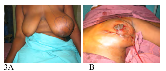
Figures 3A and 3B Shows a patient with MPT before and after reduction mammoplasty pattern wide excision.

The remaining ten patients who presented for the first time with breast lump, seven had wide local excision and LD muscle reconstruction to correct the deformity, two had reduction mammoplasty pattern wide excision (fig 3A & B) and one had subcutaneous mastectomy and silicon implant as the tumor was occupying most of the breast