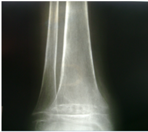
Fig.1: X-ray Rt. Ankle