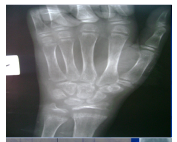
Fig 5. X- ray Lt. Wrist

Based on the history, the clinical examination, the biochemical and the radiological features; we made a diagnosis of hypophosphatemia secondary to proximal renal tubular acidosis, which is due to Fanconi syndrome.