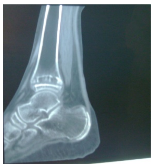
Fig.2:CT. Rt. Ankle

Afterwards a radio-isotope bone scan and bone biopsy were requested. Three phase bone scan was done with 333 MBq of Tc-99m MDP and showed abnormal increased uptake of radioactivity in the blood vessels around the joints and delayed images of both feet suggestive of reflex sympathetic osteodystrophy. Also focal increased uptake was noted in both 8<sup>th</sup> ribs and the right 6<sup>th</sup> rib posteriorly (Fig 3 and 4).