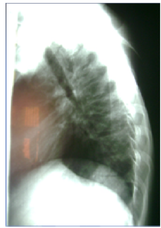
Fig 6. X- ray thoracic spine, lateral view

We prescribed the following medications: sodium bicarbonate 500 mg 6 hourly, potassium syrup 20 ml 6 hourly, phosphate tablet 500 mg 6 hourly, and alphacalcidol tablet 1 microgram OD. Physiotherapy was to be initiated when bone lesions healed. One month after starting therapy, the biochemical abnormalities returned to normal including the plasma phosphorus level and metabolic acidosis. The patient's overall quality of life improved substantially; he was able to stand and walk without problems and he returned to school after the long sick-leave.