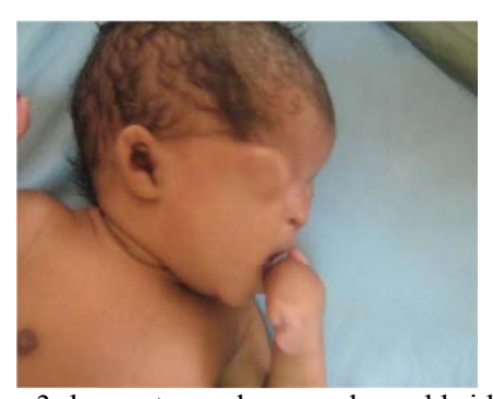
Figure 3: low set ear, depressed nasal bridge

These clinical findings were consistent with the diagnosis of Fraser's syndrome.