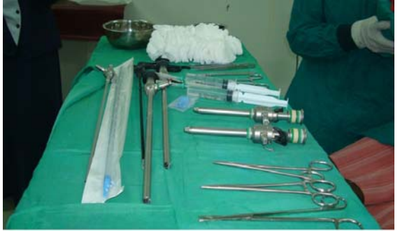
Fig 1a (two ports thoracoscope zero and 30° lenses) others tools needed for thoracoscopy.

Three types of thoracoscopies are available, rigid, flexible and semiflexible (fig 1a, 1b, 2, 3).