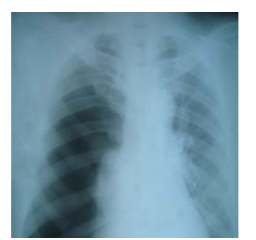
Fig (6 a): CXR (a) showed complete recurrent pneumothorax.

Talc powder can be insufflated into the pleural space to promote inflammatory response leading to symphysis of the parietal pleura and visceral pleura (fig 6 a&b).