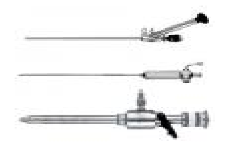
Fig 1b (single port thoracoscope, special needle and trocar and needle)