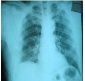
Fig (6 b): CXR (b) 3 months after pleurodesis.

Fig (6 a): CXR (a) showed complete recurrent pneumothorax.