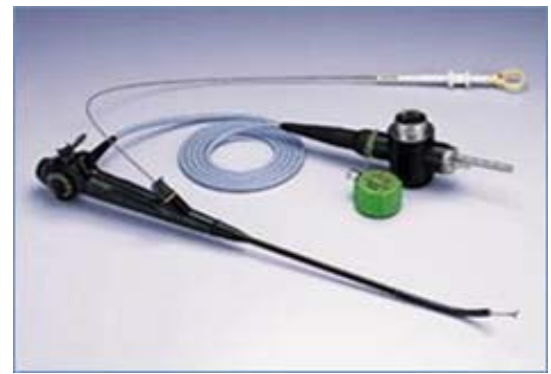
Fig (3) semi-flex thoracoscope – the first 22 cm is rigid and the last 5 cm is flexible-

The rigid one is of two types. One type with two ports of entries (one for the telescope and one for the procedure instruments), the other type of the rigid thoracscope has one port of entry in which the procedure instrument cannel is built within the telescope. Both rigid telescopes have trocars of variable types and sizes (9, 7, 5, 3.75 mm), and optical length with variable field of view, (0, 30, 90 degrees). Other instruments includes biopsy forceps and scissors and accessory instruments like puncture needle, cautery electrode, suction probe and atomizer for pleurodesis<sup>15</sup>, Flexible thoracoscope is the same scope used for bronchoscopy. Classical bronchoscope is made flexible to allow entering the bronchial tree easily. It has been used to visualize the pleural space using the same facilities of the bronchoscope i.e. the processor and light source and the screen without additional equipment. The problem with the flexible bronchoscope is the difficulty to direct it up and down in the