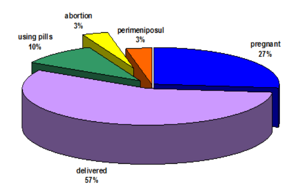
Figure1: Thedistribution ofGynecological risk factorsamong 49 female patients withdural sinus thrombosis seen at El Shaab Hospital in the period November 2008-July 2010.

Figure(3)shows that the most common radiological findings were saggital sinus thrombosis which was detected in 24 patients( 48%),followed by transverse sinus thrombosisThe outcome of the study was as follows: 36 (72%) patients recovered