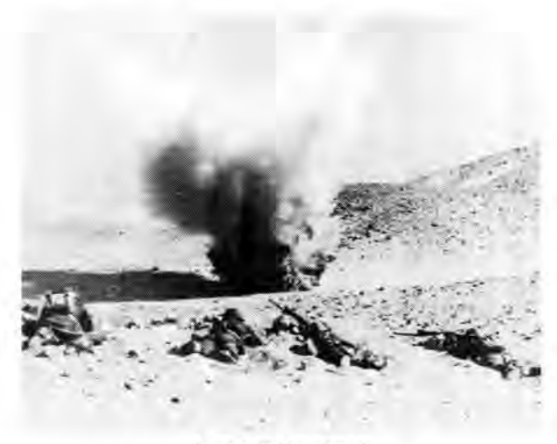
Action in the desert.

made contact with the enemy, and until the 22nd November, remained in the area, with artillery active in both sides, and the air force active on the enemy's side.