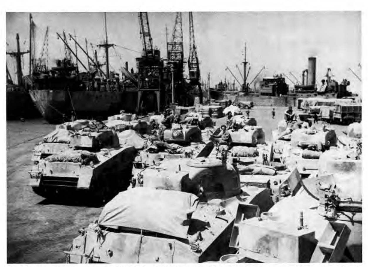
The 6 SA Armoured Division has joined other South African Forces in Italy. This picture shows a middle east port during the embarkation of the division after thorough training as an armoured division.

In April 1944 the Division crossed to Italy and concentrated in the Altamura-Matera-Gravina area. The conditions facing the Division were very different from those encoun-