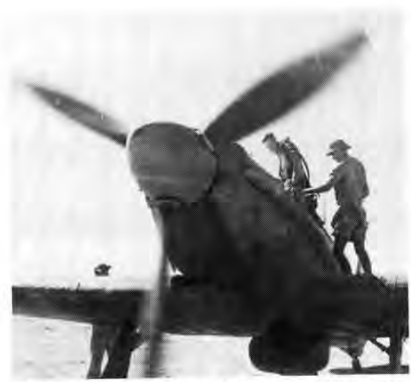
SAAF Hurricane. The Vokes air filter, installed to combat the sandy atmosphere can be seen below the propeller.

In all 2344 sorties were flown in July and 39 enemy aircraft destroyed.