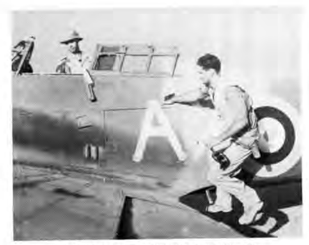
SAAF plane and pilot about to take off.

others at Diredawa, and on the 4th April, two days before the entry of the land forces, 30 aircraft were destroyed on the aerodrome of Addis Ababa.