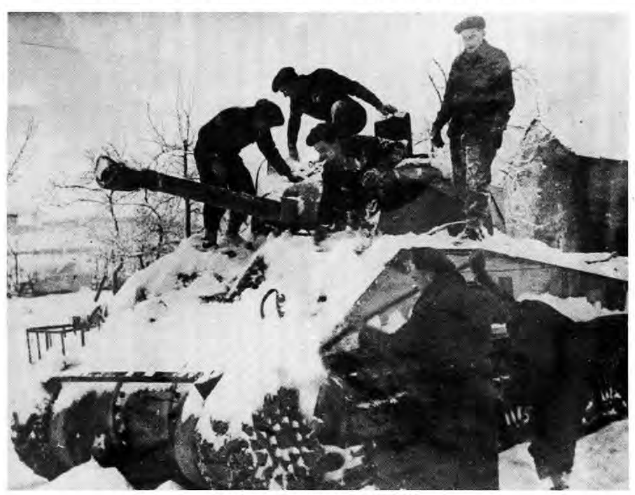
A Sherman tank in the Appenines: 1944.

The casualties suffered by the Division during this period totalled 2042.