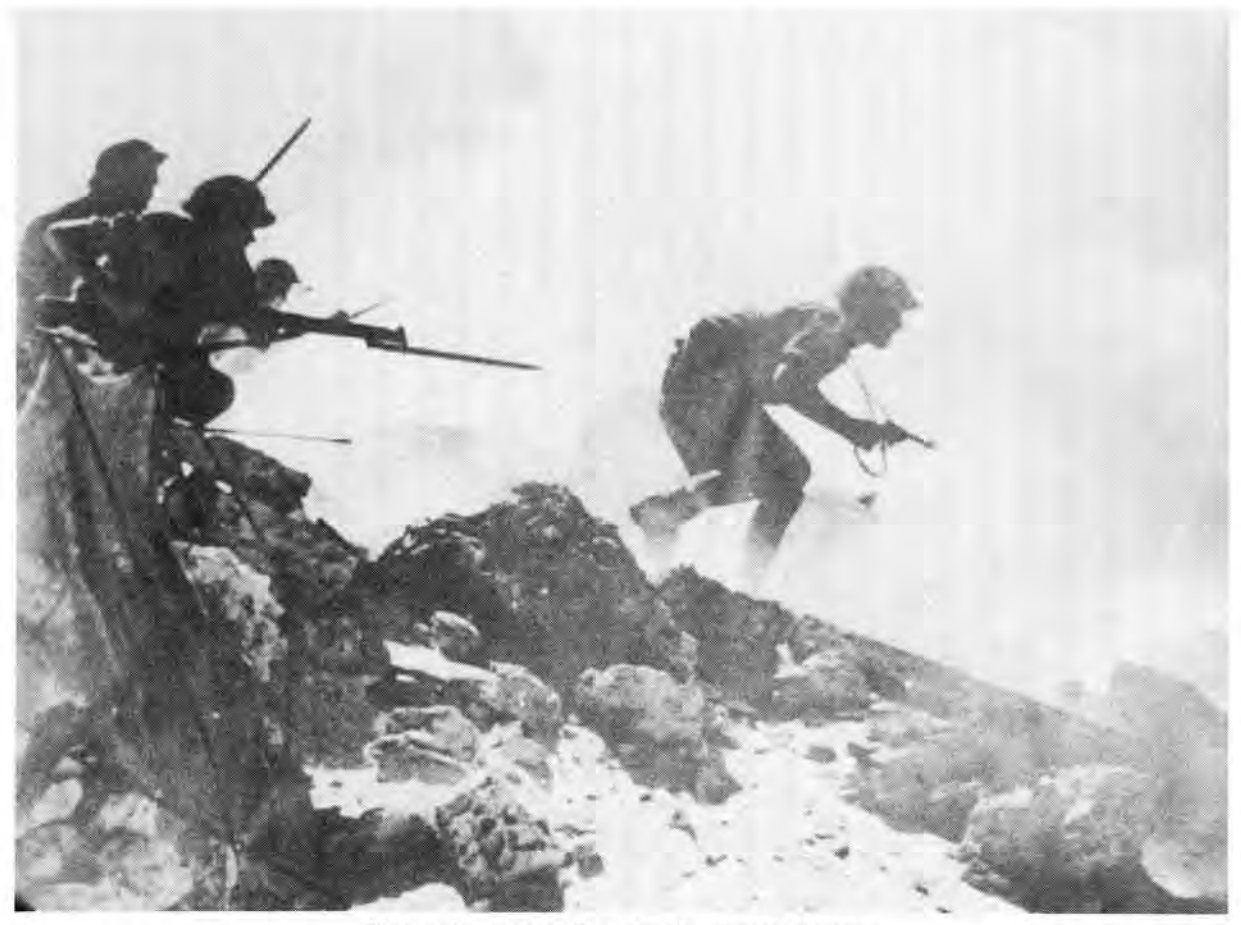
El Alamein - a scene from the film "Desert Victory".