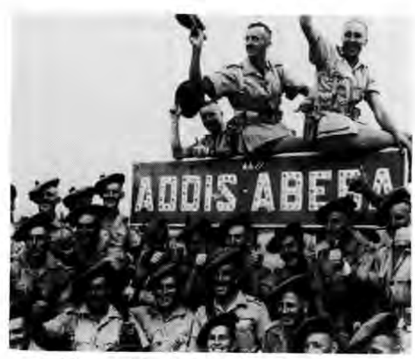
Transvaal Scottish entering Addis Ababa.

On the 1st May, 1 Royal Natal Carbineers occupied Waldia, and four days later Campbell's Scouts entered Alomata. The Brigade now advanced on the mountain position of