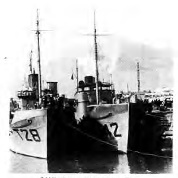
SANF minesweepers at Cape Town.

left for the Mediterranean to join the Fleet. They were known as the 22nd A/S Flotilla, and arrived in Alexandria on January 11th, 1941. The position in the Mediterranean was then highly critical, and the small flotilla was almost immediately used to protect the exposed sea-route to Tobruk, a type of work quite new to the officers and men.