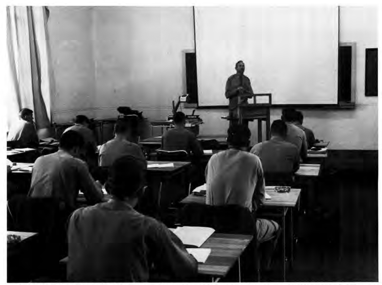
Although language training often takes place in the field or under operational conditions, classroom tuition, as in other non-language courses, remains essential.

From its establishment in 1912 to the present, in its seventy six years of existence, effective language use in both official languages, Afrikaans and English, has always played a main role. Indeed, it is incorporated in the provisions of Section 137 of the Defence Act, 1957 as amended. Certainly, orders, commands and instructions are conveyed by means of the spoken and written word. In terms of its language policy the SADF alternates the official language used in correspondence monthly, and lectures at its training establishments are presented alternately in English and Afrikaans. Hence the SADF may rightly claim the highest possible measure of bilingualism.