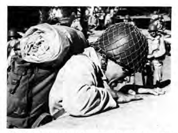
He and his buddies have a hard time ahead but they will probably become life-long friends and communicate in one another's languages.

The SA Defence Force Language Service is the pioneer in South Africa in the field of computerised terminological and lexicography services. Its publications including the Joint Military Dic tionary, Personnel Management Dictionary, Artil lery Dictionary, Naval Dictionary, Ammunition Dictionary, Weapons Dictionary, Glossary of Tactical and Strategic Terms, Financial Diction ary etc. are compiled by way of computer, thus saving cost and manpower and facilitating more rapid producion.