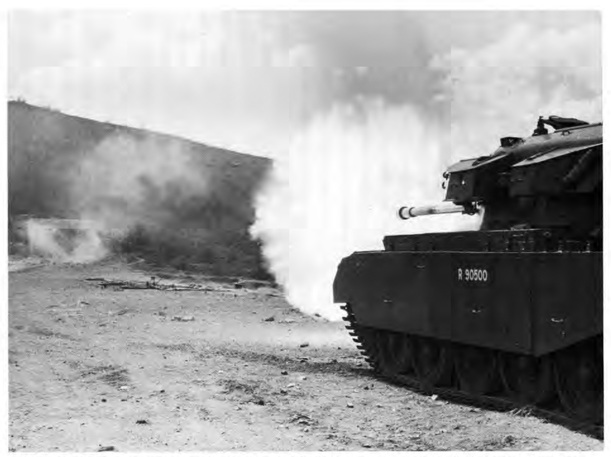
When a tank engages a target, many language communication processes precede the final command "Fire", from interpretation of the situation, solving the problem posed, to executing the task by firing at the target.

This leadership is maintained and perpetuated by the establishment of a Military Language Service in 1968. And over the years this language service expanded and developed into the largest such service in the country because the needs of the SA Defence Force in the field of language communication are so great. Official documents are translated, manuals, directives, speeches, press releases are issued in both official languages, language guides are compiled and distributed, thousands of members receive language instruction, immigrants learn Afrikaans and English, Black members learn the official languages, White members learn African languages and many members of the Defence Force learn languages such as French, German, Spanish, Portuguese, Hebrew, etc. In addition, the SADF Language Service liaises with all language bodies and authorities in an effort to improve the quality of language communication for the quality and effectiveness of the training, battle handling, liaison and intelligence depends largely on the effectiveness of our language usage. And obviously liaison with our multiracial population is done best by medium of their own languages. So the SA Defence Force helps to