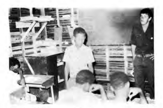
Teaching Afrikaans and English to members of local populations is an important cultural contribution by the SADF.

The Language Service of the SA Defence Force is a directorate headed by a brigadier and it comprises 3 sections, each led by a deputy-director or colonel: language Teaching and Testing, Terminology and Translation Services.