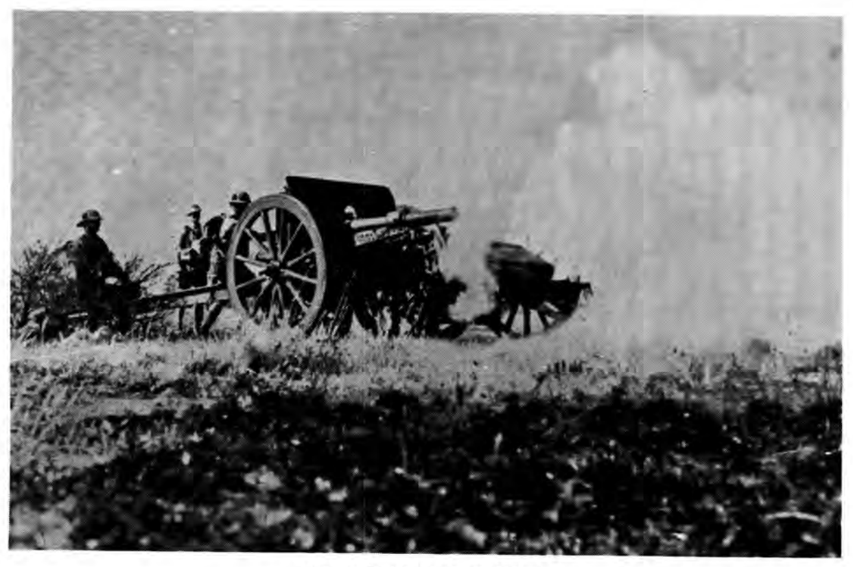
Artillery Training in South Africa