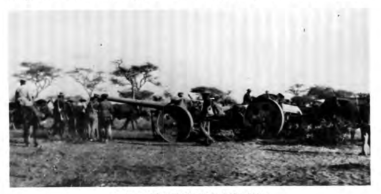
SA Horse Artillery with Guns in South West Africa

After the cessation of hostilities, a number of farreaching changes in the administration of the Defence Force took place. Purely military policy had formerly been directed by the Minister through the Secretary for Defence but in 1918 the responsibility for the co-ordination of all mili-