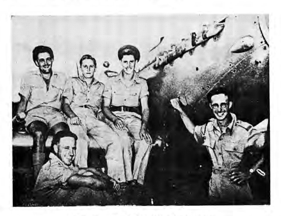
Groundcrew with a Spitfire. Note the 20mm gun

On 27 August orders were received for the Squadron to move to El Gamil airfield at Port Said.