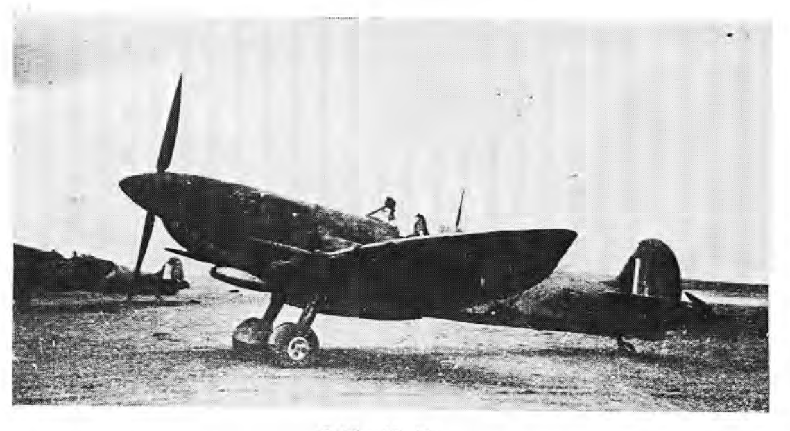
Spitfire Mk VIII

The rest of September was spent on bombing missions. 53 missions were flown against buildings, guns, flak positions, dumps, railways, bridges, headquarters and tanks. Forty direct hits were recorded on buildings, 10 on roads and one on a bridge. Only 5 MT were