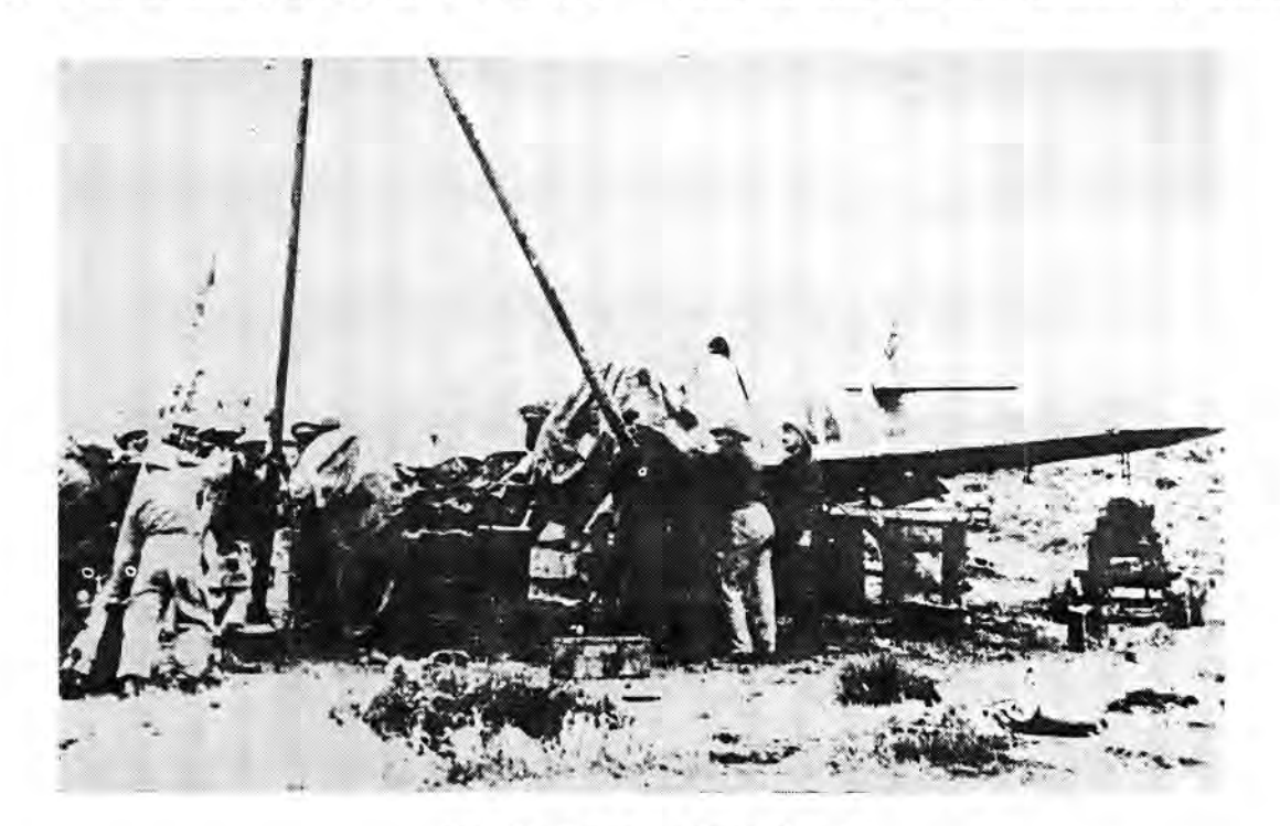
ME 109 salvaged at Mersa Matru

Two days later news was received over the radio that Kos was being attacked by German