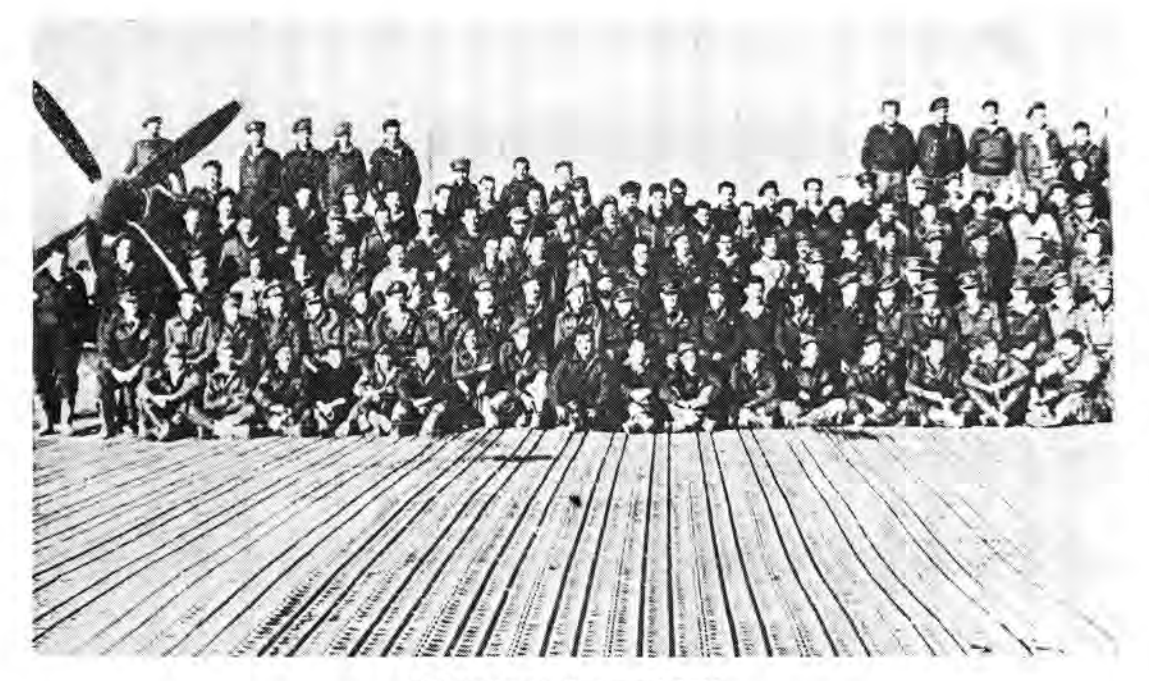
7 Squadron's Personnel 1944