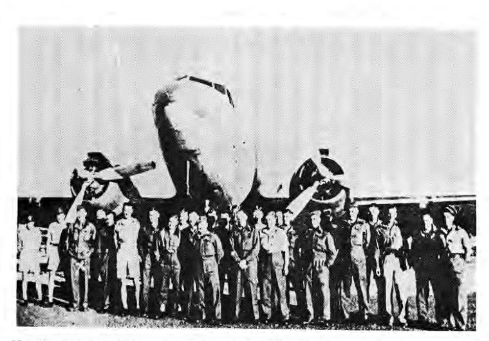
Maj Kershaw returning to the Union of South Africa after being released from a P.O.W. Camp

The weather worsened and hampered missions. On a number of occasions the aircraft had to turn back due to poor visibility.