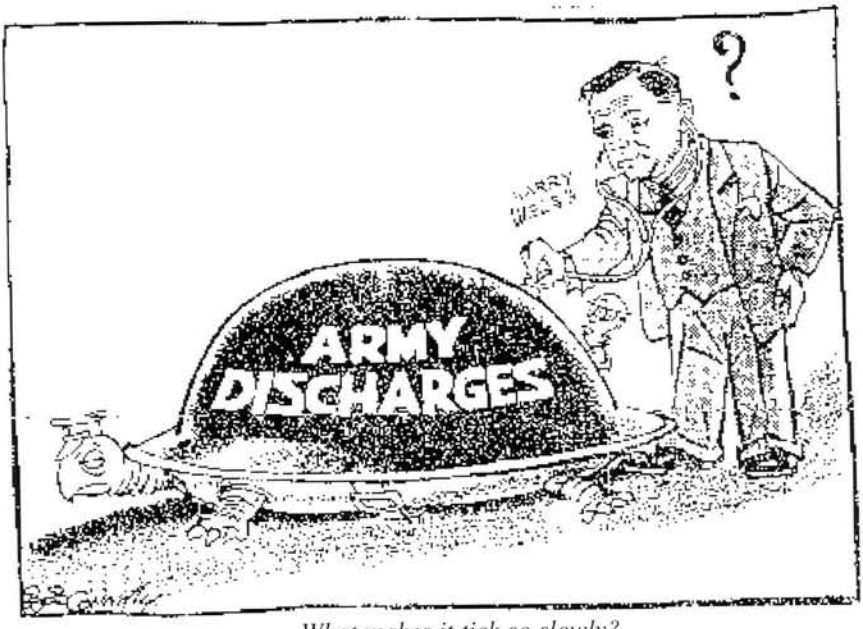
What makes it tick so slowly?

K.J. Gibbs states that the South African economy was not ready to receive the ex-soldiers. The post-war difficulties in acquiring new machinery, and raw material due to shipping problems, prevented industrial expansion which was necessary to provide employment opportunities.<sup>29</sup> In this regard the Union differed significantly from the demobilisation approach adopted by the