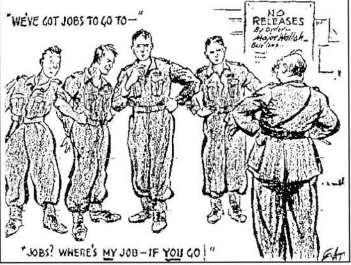
- Evo in the Natal Mercury

set an example to other employers with regard to the provision of employment. In orachieve this, government employment was taken care of by the Directorate of Demobilisation and aimed to establish and main-