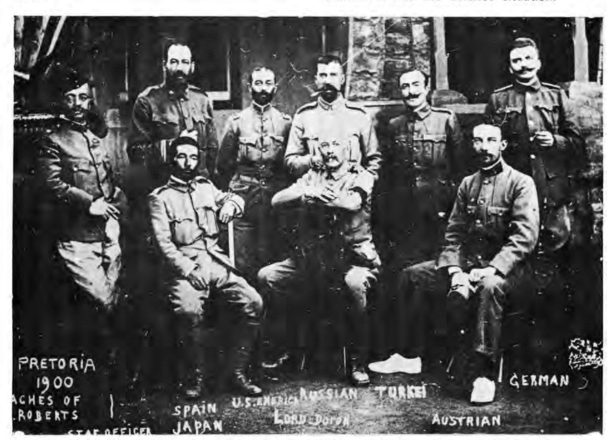
The military attachés with the British army in South Africa, photographed in Pretoria during January or February 1901 (not 1900)

Besides the above mentioned envoys there were more: on 22 February, after Lord Roberts' refusal to send Cronjé doctors on his terms, the latter again asked not only for doctors, but for a hospital to be sent to him - without changing his original conditions of keeping the doctors till the end of the siege. Naturally Lord Roberts refused. On 23 February Lord Roberts dispatched someone to find out the number of English prisoners in the Boer camp. Cron'é sent him a list of names (16 men). Lord Roberts made him the proposal to exchange prisoners. Cronjé agreed and the exchange took place . . . We see from the above that there was daily intercourse between the besieged and the besiegers. Many of these must be acknowledged to be quite superfluous - that is if other secret negotiations were not taking place at the same time. It is also very odd that Cronjé agreed to the exchange of prisoners - for by doing so he was revealing camp conditions and the defence situation.