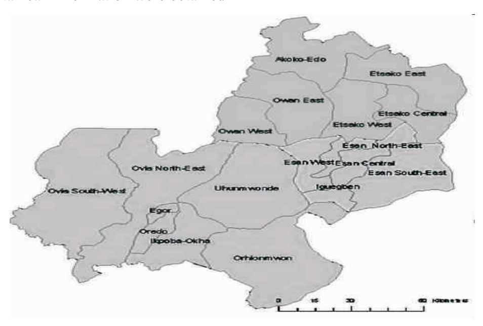
Figure 1. Map of Edo State showing Esan North East, the study area.

in both Delta and Edo States. These two states are located in the southern parts of Nigeria. The two states were created from one former southern state called Bendel. They both maintain similar ecological zones as coastal states as well as rainforest vegetation.