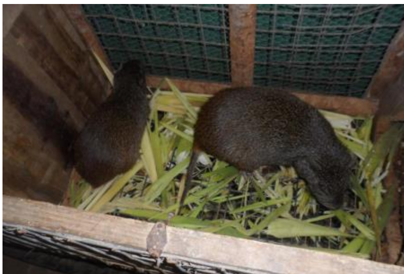
Plate I: Adult greater cane rats ( Thryonomys swinderianus ) in captivity

and breeds described may be allied to either: T. swinderianus (Greater grasscutter) or the T. gregorianus (the Lesser grasscutter) (Alogninouwa et al. , 1996). The thickest body measurement ranged from 40 to 60 cm in addition to 20-25 cm tail (Senou et al. , 1992). Body weight fluctuates between 2 and 4 kg and furs could be mixtures of brown, reddish and grey hairs that change with habitat. The species inhabits dense, reedy grassland with damp or wet places (Ajayi, 1971, Abioye et al. , 2008). Distribution of cane rats is determined basically by the availability of adequate or preferred grass species for food (Ajayi, 1971).