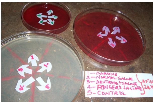
Plate 1a No growth after 48 hours culture at 37 0C in Blood, Nutrient and MacConkey agars Plates showed no evidence of microbial growth from preservative solutions cultured after 24 hours organ storage

There was no growth in all cases (Plates 1a & b).