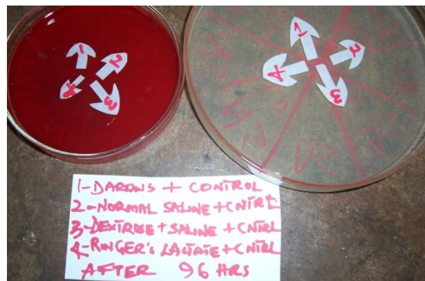
Plate 1b No growth after 48 hours culture at 37 0C in Blood and nutrient agars Plates showed no evidence of microbial growth from preservative solutions after 96 hours organ storage