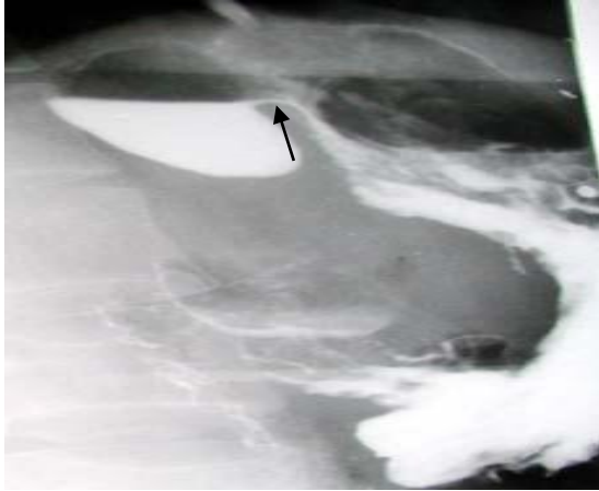
Plate I: Single contrast barium meal of the abdomen of the bitch 40 minutes post ingestion of the contrast agent. Note the diverticulum: arrow.