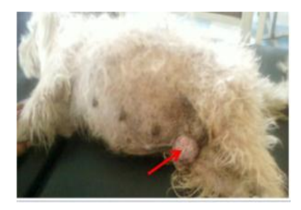
Plate VI : Twelve year old Lhasa apso with mammary adenocarcinoma two years after ovariohysterectomy was performed secondary to closed pyometra