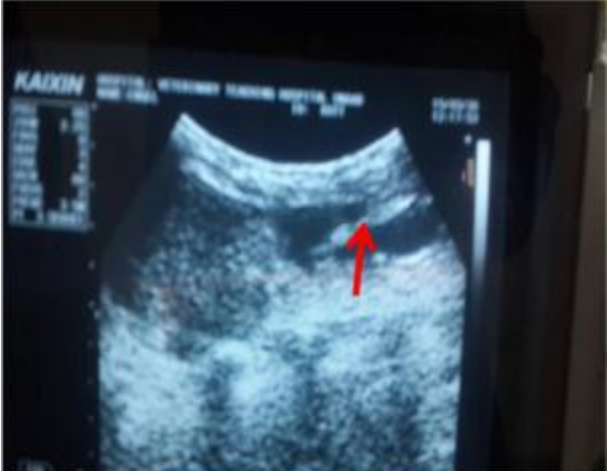
Plate V : Abdominal ultrasound of a five year old Rottweiler with intra-uterine foreign body (Arrow)