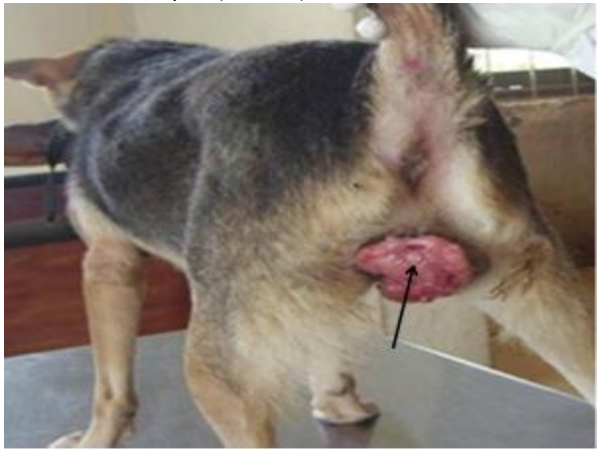
Plate IV : Four year old Alsatian cross with peri-vulva transmissible venereal tumour (Arrow)