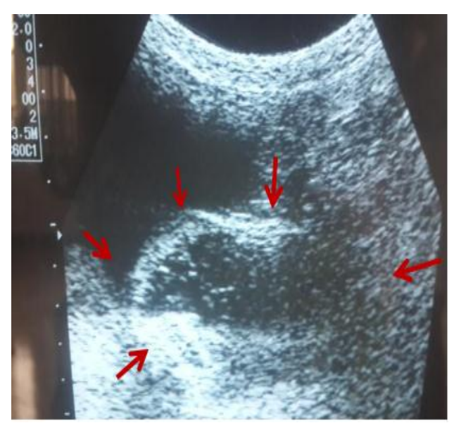
Plate I : Transcutaneous abdominal ultrasound of a three-year-old Boerboel bitch showing dilated bowel loop (arrows)