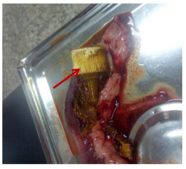
Plate VI : Plastic bottle cap removed from the intestine of a three-year-old Boerboel bitch

During post-operative management, tramadol injection at 4 mg/kg was administered intramuscularly. In addition, 4 mL of