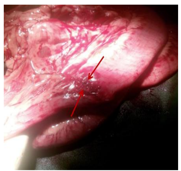
Plate V: Anastomosed segment of the intestine (arrows) of a three-year-old Boerboel bitch following resection to remove a foreign body

infusion of propofol at the rate of 0.12mg/kg/min. Following anaesthesia, the dog was positioned in dorsal recumbency and the legs were secured to the edges of the table using gauze bandage. Finally the abdomen was disinfected again and sterile drapes were applied. A ventral midline incision was made on the skin. After careful dissection of the subcutaneous tissue, the linea alba was located and a stab incision was made on it. The incision was then lengthened using a pair of myo-scissors to gain access into the abdominal cavity. The intestine was then exteriorized and explored (Plate IV). After locating the foreign body, it was observed that there was moderate inflammation of the segment of the intestine around it thus the intestinal segment was resected and anastomosed using an end-to-end anastomosis technique (Plate V). The foreign body (Plate VI) was observed to be a plastic bottle cap. The anastomosed intestine was rinsed and then returned into the abdominal cavity and 5 mL of Penicillin-streptomycin (PenStrep<sup>°</sup>, Kepro, Holland) was infilterated. The laparotomy incision was then closed in three layers. The linea alba was closed with double rows of simple continuous suture pattern using size 1 catgut. The subcutaneous tissue was closed with subcorticular pattern using size 0 chromic catgut, while the skin was closed with horizontal mattress suture pattern with size 0 polyester.