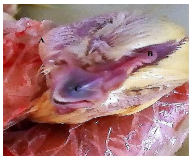
Plate V : Edema of the head with swollen eye ( C ), discoloration of beak ( B ) and comb ( A ) in a broiler from fB

Inoculated eggs were kept at 37°C and examined daily for embryo survival or death. Dead embryos observed post inoculation were chilled at 4°C. Allantoic fluid (ALF) was harvested from the eggs on the second day of inoculation after embryo death and tested for haemagglutination (HA) activity using 10% pooled chicken red blood cells. Bacterial free isolates were banked in ultra-low freezer for future characterization.