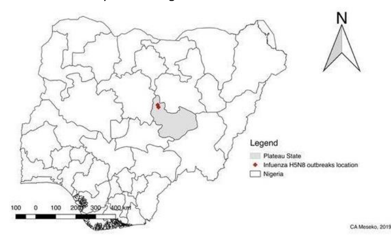
Figure 1 : Map of Nigeria showing locations of the February, 2019 outbreaks of HPAI H5N8 in Jos metropolis of Plateau state, Nigeria

The role of wild birds in the epidemiology of HPAI in Nigeria has been described by Meseko et al. (2018). Nigeria lies within 3 major international migratory flyways such as the East-Africa-Asia flyway, Atlantic-America and Black Sea/Mediterranean flyway which make the country a thorough fare for birds on