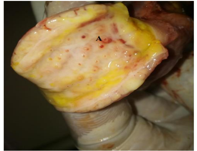
Plate IV: Pinpoint haemorrhages ( A ) in the proventriculus in a pullet from fA observed at necropsy

PCR assay targeting the matrix (M) gene as described in Spackman et al. (2002) using the GeneAmp<sup>®</sup> Gold RNA PCR core kit in a 9700 thermocycler (Life Technologies, Foster City, CA, USA). M-gene positive samples were thereafter subtyped for haemaglutinin H5 gene and simultaneously for neuraminidase N1, N8 (Slomka et al., 2007). The PCR products that were amplified were then analyzed by gel electrophoresis in 1.5% agarose that was stained with ethidium bromide (SIGMA, Germany). The gel products were visualized in Gel Documentation System (Biostep, Germany). Samples that were positive for H5 and N8 in the molecular technique were further processed for virus isolation by inoculating them in specific antibody negative chicken embryonated eggs according to OIE standard (OIE, 2015).