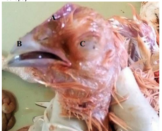
Plate V: Edema of the head with swollen eye ( C ), discoloration of beak ( B ) and comb ( A ) in pullet from fA

PCR assay targeting the matrix (M) gene as described in Spackman et al. (2002) using the GeneAmp<sup>®</sup> Gold RNA PCR core kit in a 9700 thermocycler (Life Technologies, Foster City, CA, USA). M-gene positive samples were thereafter subtyped for haemaglutinin H5 gene and simultaneously for neuraminidase N1, N8 (Slomka et al., 2007). The PCR products that were amplified were then analyzed by gel electrophoresis in 1.5% agarose that was stained with ethidium bromide (SIGMA, Germany). The gel products were visualized in Gel Documentation System (Biostep, Germany). Samples that were positive for H5 and N8 in the molecular technique were further processed for virus isolation by inoculating them in specific antibody negative chicken embryonated eggs according to OIE standard (OIE, 2015).