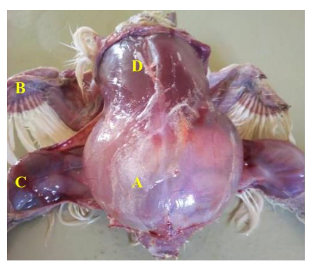
Plate I : Swollen abdomen (A) and subcutaneous haemorrhages in the wings (B), thigh (C) and breast muscles (D) in a dead broiler from fA

Clinical examination of the moribund birds from fA revealed depression, diarrhea, hock sitting, edema of the head with cyanosis of the comb and wattle. The gross lesions observed with the broilers from both farms were similar and include: massive subcutaneous haemorrhages and discoloration of the head, comb, beak, breast, thigh and shank due to congestion; massive swelling of the abdomen (ascites) with adhesion of abdominal organs; fibrinous pericarditis and perihepatitis; generalized congestion and suffusion of visceral organs with frank blood in the abdomen; highly congested and enlarged spleen with diffused necrotic foci; congested mesenteric vessels with haemorrhages in the