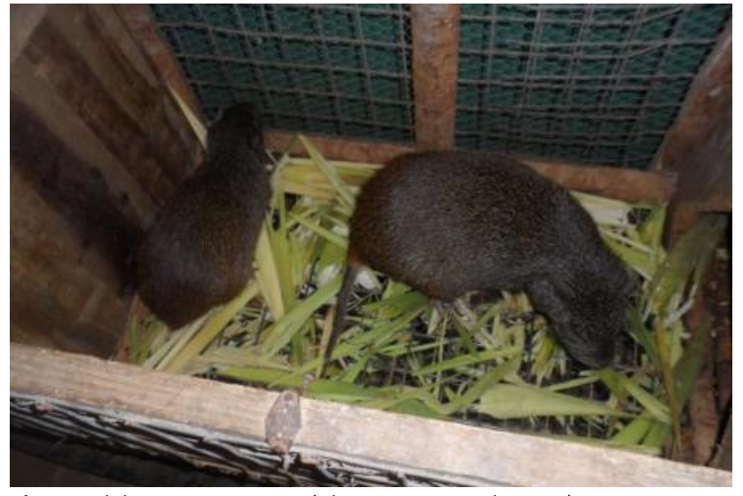
Plate I: Adult greater cane rats (Thryonomys swinderianus) in captivity

and breeds described may be allied to either: T. swinderianus (Greater grasscutter) or the T. gregorianus (the Lesser grasscutter) (Alogninouwa et al., 1996). The thickest body measurement ranged from 40 to 60 cm in addition to 20-25 cm tail (Senou et al., 1992). Body weight fluctuates between 2 and 4 kg and furs could be mixtures of brown, reddish and grey hairs that change with habitat. The species inhabits dense, reedy grassland with damp or wet places (Ajayi, 1971, Abioye et al., 2008). Distribution of cane rats is determined basically by the availability of adequate or preferred grass species for food (Ajayi, 1971).