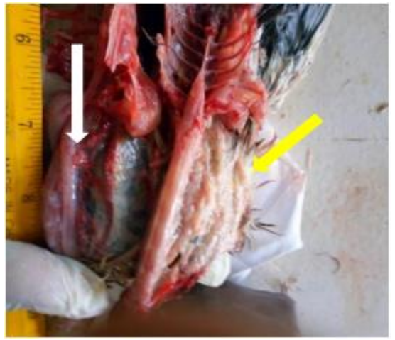
Plate VI: Thymus of an infected chick that died on day 7PI showing severe atrophy and congestion of the thymus (white arrow) against its control which showed apparently normal thymus (yellow arrow)

the ducks to XIVb strain of NDV than the chickens. This finding may be lower than the findings of Eze et al. (2014) who recorded 25% mortality with KUDU 113 which is also a velogenic viscerotropic NDV strain (that is similar to strain XIVb) in the infected ducklings against the infected chicks with 58.3% mortality, but still indicated that the ducks were also less susceptible to NDV KUDU113 strain as they were to XIVb strain of NDV in this study compared to the domestic chicks. The variability in the findings could be as a result of the age of the subjects, individual genetic makeup, or differences in resistance shown by the subjects to the strain. The result in this study for chicks is in line with findings of Sa'idu et al. (2006)