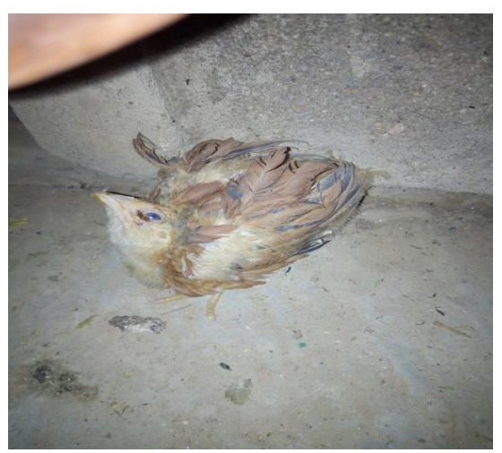
Plate II: The only survivor of the infected chicks showing torticollis on day 18 PI