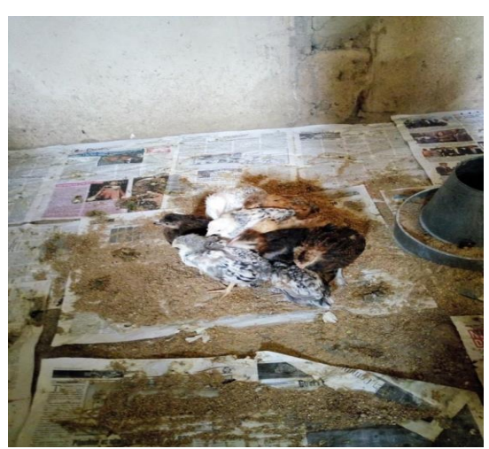
Plate I: Infected chicks showing depression and huddling together on day 5PI