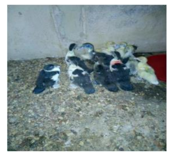
Plate III: An infected duckling showing depression on day 14 Pl (arrow)