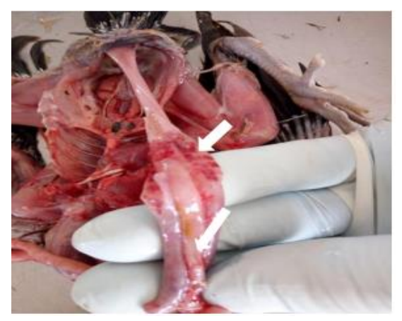
Plate VIII: Large intestine of an infected chick that died on day 5PI showing haemorrhages in the caecal tonsil and the caecae (arrows)

who reported 92% mortality and a morbidity of 100% in local chickens infected with NDV KUDU 113 strain. The lower organ-body weight ratio obtained in the infected chicks and ducklings than their control counterparts could be due to the viral tropism in many organs and tissues of the birds which destroys the tissues or set them to atrophy. This finding is in agreement with that of Dortmans et al. (2011) who reported viral tropism and atrophy in many organs of chickens experimentally infected with Pigeon paramyxovirus - 1. It is also in line with the findings of Igwe et al. (2014) who reported atrophy in lymphoid organs of guinea fowls and chickens experimentally infected with Kudu- 113. This could also be attributed