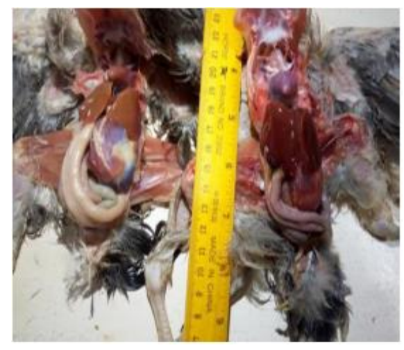
Plate IV: Carcass of an infected chick (IC) that died on day 7PI showing congested visceral organs and thigh/ breast muscles as compared to its control (CC)