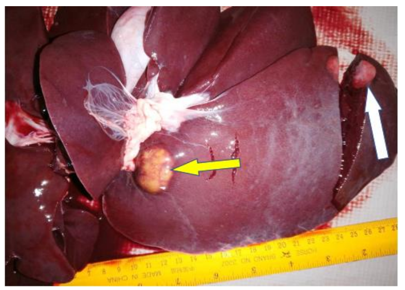
Plate I : Liver showing a cyst filled with clear mucoid fluid (yellow arrow) while the white arrow indicates a deep-seated nodule on the ventral aspect of the right lobe

surgical investigation for other clinical indications or even postmortem examination (Nasrin et al. , 2012). Large, multiloculated biliary cystadenomas with internal septation and nodularity are frequently surrounded by a dense cellular fibrostroma (Averbukh et al. , 2019). Although cystadenomas can be unilocular in rare cases, multilocularity is a fundamental trait (Cho et al. , 2005). The tumour usually manifests histologically by focal or multicentric cystic proliferation of biliary epithelium involving one or more hepatic lobes (Adler & Wilson, 1995). This report documents a case of biliary cystadenoma in a Caucasian dog in Jos city, Nigeria.