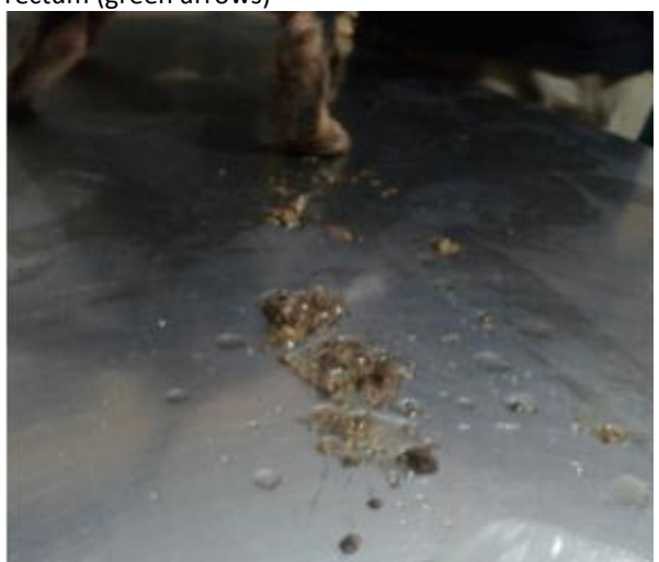
Plate III: The impacted sand particles voided