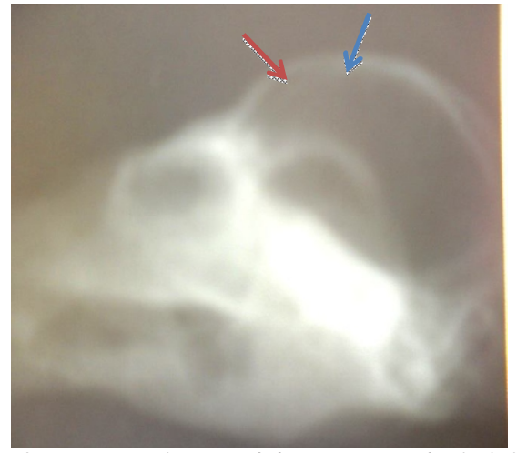
Plate II: Lateral view of first trimester fetal skull showing radiolucent calvarium (red arrow) and anterior fontanele (blue arrow) [Magnification ×125]

The calvaria of the first trimester fetuses had clear appearing radiolucent on the fontaneles, radiographs (Plates I & II), and the fontaneles tended to disappear with advancement in age at the second and third trimesters stages (Plates III & IV). The radiographic findings revealed the prominence of the anterior fontanele which appeared translucent (dark) with a relative radio-opaque (white) surrounding at the level of first the trimester aged fetuses. There was slight radio-opacity of the calvaria in the first and second trimester fetuses relative to the third trimester fetuses at which stage radio-opacity became more widespread and progressively prominent. Fetal heads at third trimester had greater radiopacity which appeared much whiter on the radiographs (Plate IV).