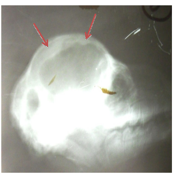
Plate IV: Lateral view of third trimester fetal skull showing a relative radio-opacity of the calvarium indicating heavy calcification (Red arrows) [Magnification ×125]

A radiographic picture of the head is a valuable aid for diagnostic purposes and for research concerning the growth of the head in humans and animals (Anonymous, 2011). In many instances, a radiograph of the head according to Shojaei et al. , (2008), is used as a representation of the bony and soft tissues of the head; however, the soft tissues as well as the complex arrangements of numerous structures of the head may influence the measurements of the bony parts, thus making a radiographic anatomy of the head region difficult to understand. This