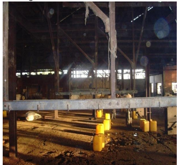
Plate III : Sokoto abattoir: vandalized rail and hoisting system which are non-functional