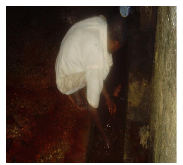
Plate I: Zango abattoir showing butcher washing meat in gutter