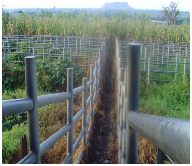
Plate II : Zango abattoir: showing non-functional lairage overgrown with plants

The non-functional facilities and level of dilapidated infrastructures recorded in this work could not have supported standard operating procedure and good hygiene practices in the abattoirs and this situation may pose danger to the public health as pointed out by Adeyemo (2002) in Bodija abattoir in Ibadan, Nigeria. Considering the fact that lairage plays an important role in the abattoir, where resting of animals take place and ante-mortem inspection undertaken prior to slaughter, however the findings of this work indicated dilapidated condition of the lairage (Plate II) was due to unwillingness of the workers or lack of enforcement to use it.