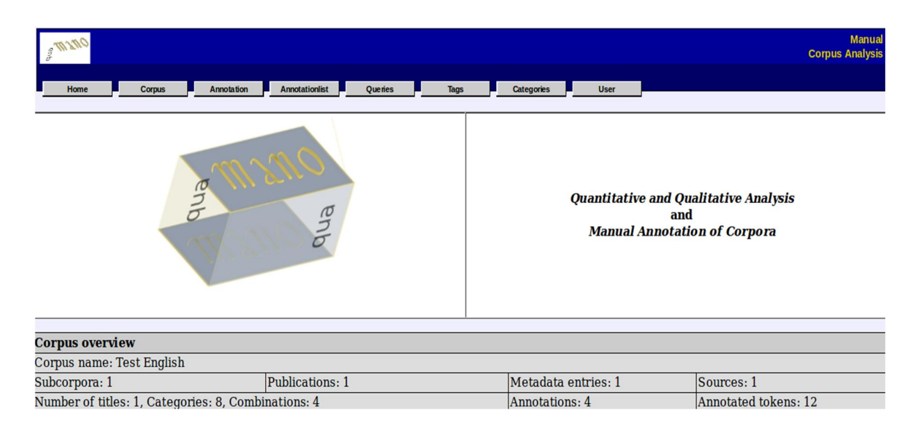
Figure 2. Qua Mano's welcome page

A demonstration of Qua Mano's basic features will be provided in the penultimate section of this paper.