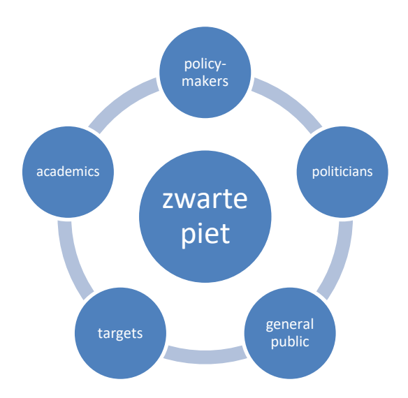
Figure 2: Zwarte Piet

The vehemence of the debate has several causes, I think. First of all, it is assumed to be perilous for the debate to be carried on openly while new generations of children are meant to believe in Sinterklaas and Zwarte Piet , which, as stated, is something urgently wished for. Secondly, Sinterklaas has become an icon of Dutch national identity at a time when national identities are being threatened or at least questioned in a time of European unification and globalization. Sinterklaas and Zwarte Piet are an integral part of a nationalist narrative. Again, different voices may be heard within the debate.