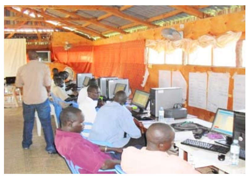
Figure 2. County Health Officers practice their skills in HMIS and DHID during training conducted in Bor, Jonglei State in 2010, organized by IMA and the State Ministry of Health.

Six months after the start of activities, the MOH organized a review meeting (8). State and counties representatives, NGOs, UN Agencies and donors contributed their experience and helped finalise tools and discuss strategies. The main achievement was an agreed reformed list of indicators with programme data elements and the first integrated routine monthly report for all health facilities. The report had two sections. Part 1 included all routine service indicators to measure performance of high impact services; Part 2 incorporated information on communicable diseases relevant for the