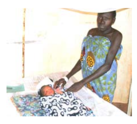
Figure 3: Woman and baby after an elective section in Yei Civil Hospital

live near the hospital until they deliver may reduce maternalmortality from obstructed labour. systematic review of primary level referral systems for emergency maternity care developing in countries found that maternity waiting homes