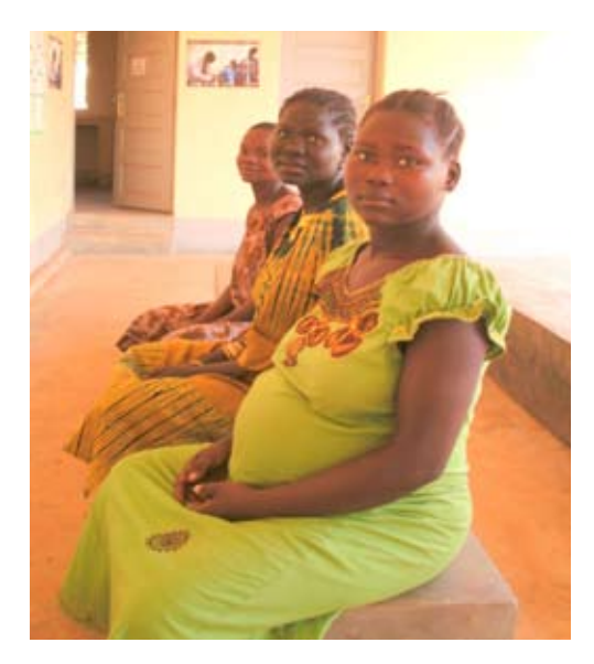
Figure 1. Ladies at the new ante-natal clinic

The position of the head can adversely affect the progress of labour. If it is tilted (asynclitic) or erect instead of flexed (this is sometimes called military!) the head will not stimulate regular effective contractions. During training midwives should learn all the possible positions of the head and how to feel for them.