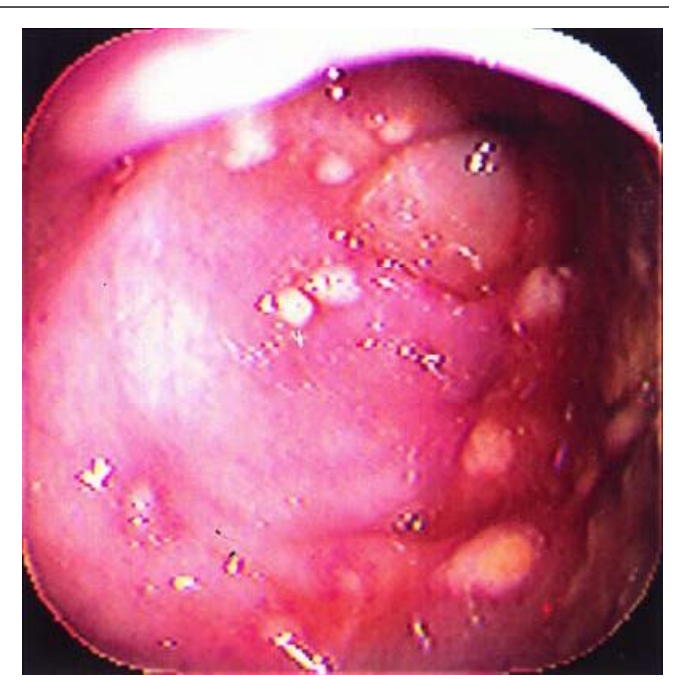
Figure 1. Pseudomembranous colitis at colonoscopy with multiple yellowish patches ("pseudomembranes") and erythematous, friable mucosa. (From Limaye et al , 2000].

C. difficile has been isolated globally from environmental sources both in and outside the hospital. Although most