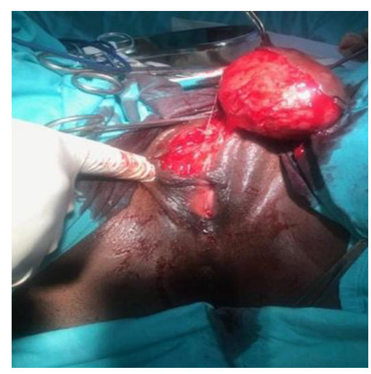
Figure 2. Successful dissection of the surrounding structure