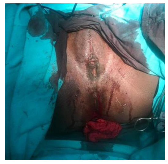
Figure 3. Vulva cosmetically re-fashioned

The woman had normal secondary sexual characteristics and no feature of hyperandrogenism. A 10cm by 8cm rounded non-tender, mobile, cystic mass with normal overlying skin involving the right periclitoral area, residual labia minora, mons pubis and stretching the ventral skin of the urethra was noted (Figure 1). The residual clitoris was palpable beneath and separate from the cyst; thereby ruling out clitoromegaly. The vagina, cervix, and uterus were normal on speculum and digital examinations with no palpable inguinal lymph nodes. Other systems were normal as were the investigation results. An informed consent for surgical excision was obtained followed by successful excision without complications (Figure 2).