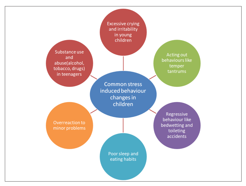
Figure 1. Common stress induced behaviour changes in children.