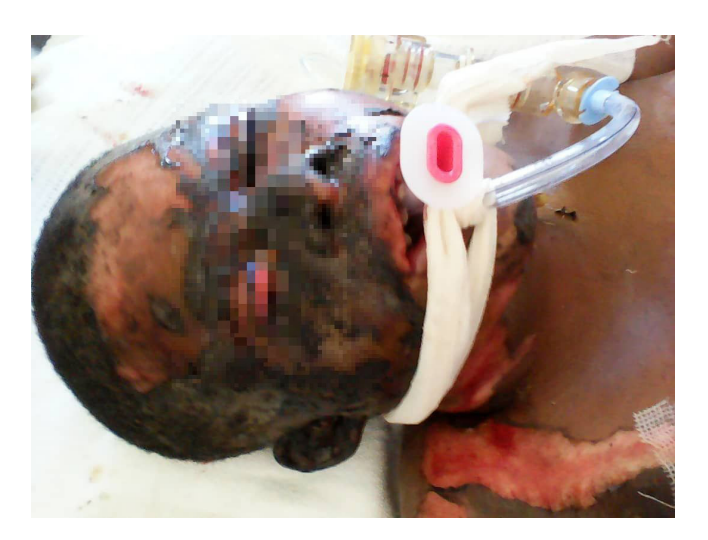
Figure 2. The tube was secured in place

The technique is simple, atraumatic, and does not add complications of its own although the risk of complications is relative and vary with the experience of performing the technique. One of the complications attributable to retrograde intubation was a small peri-tracheal hematoma in one patient that required no treatment. Akinyemi et al.<sup>[3]</sup> in reviewing complications of retrograde intubation