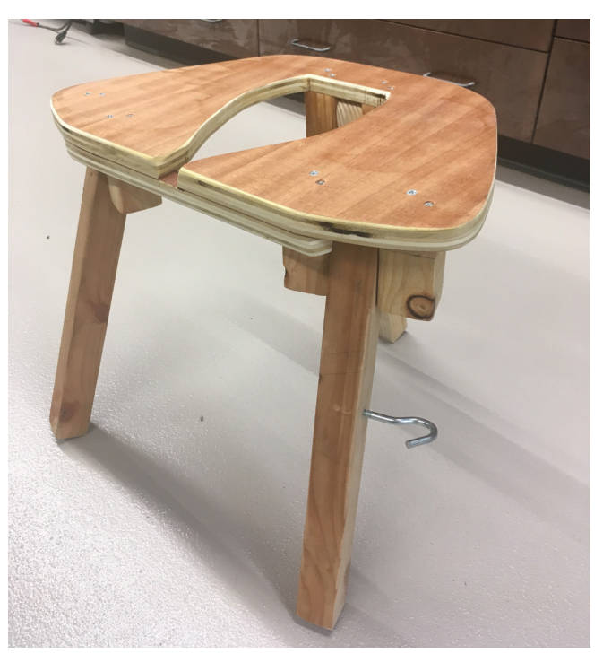
Figure 1. Tripod Stool

Figure 2 is a foldable latrine assistive device that costs approximately $13 USD to fabricate in Uganda. The hand rails provide support while the user is getting onto the seat, and there are several contact points with the ground to make the device feel more stable. The design of this device requires use of plywood that is 9 cm thick and a total of 12 hinges, and it also uses a wood paint that ensures ease of maintenance. All of the material can be found in a local carpentry shop in any rural parts of Uganda.