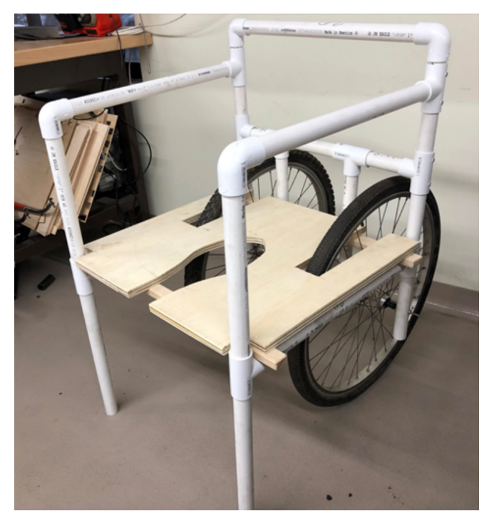
Figure 3. Mobile PVC Walker

The box seat in figure 2 was mainly designed for lowstrength individuals who need the support of hand rails to lift themselves. This device received positive feedback unanimously from all users during in-field testing, and