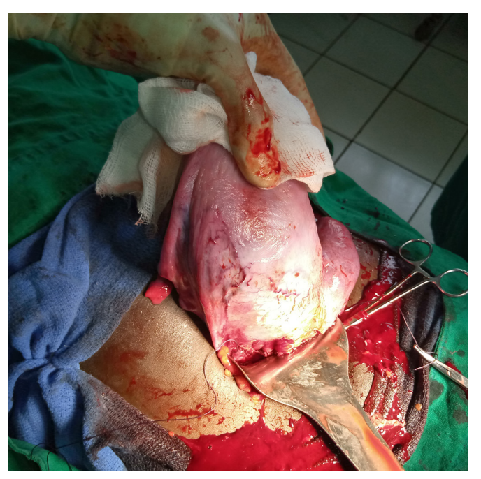
Figure 2. Case 2. Double uterus – anterior view

ultrasound. She had one antenatal clinic (ANC) visit at a nearby health centre where ultrasound scan was done. She was referred on February 8th 2019 to Ras Desta Damtew Memorial Hospital, Addis Ababa, Ethiopia following presentation to the health centre with "pushing down" pain and vaginal bleeding for two hours.