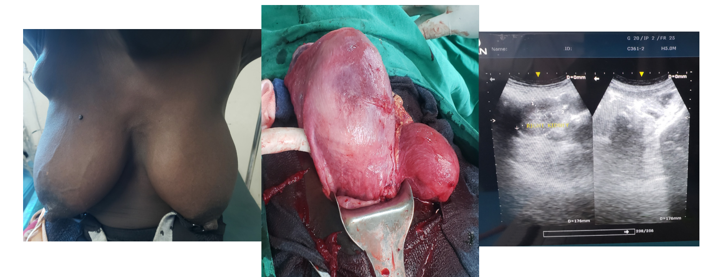
Figure 4a. Accessory breast.

Findings on arrival were, term size fundal height, longitudinal lie and breech presentation. She had three contractions every 10 minutes. Fetal heart rate was 134 to 148 bpm. Cervix was fully effaced, and 5 cm dilated. Presentation was footling breech with intact membranes. There was another left lateral short cervix which was closed; no vaginal septum was encountered. There was right axillary accessory breast tissue (Figure 4a).