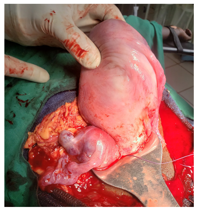
Figure 3. Case 3 – Double uteri – anterior view

in the right uterus. Both kidneys were palpated in their normal positions. No other congenital anomaly identified. She had a smooth postoperative course and discharged on the 3rd postoperative day with haemoglobin of 10.3 g/ dl. (Figure 2).