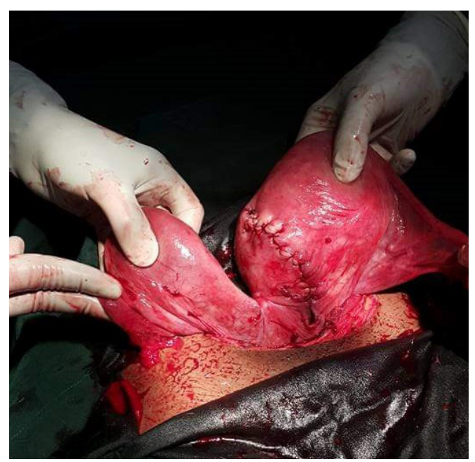
Figure 5. Case 5. Double uterus – anterior view.

Ultrasound showed a single fetus, breech presentation with fundal placenta. No anomaly seen. Gestational age (GA) was 38 weeks and EFW of 3.8 kg. Primary Caesarean Section was undertaken because of the footling breech presentation.