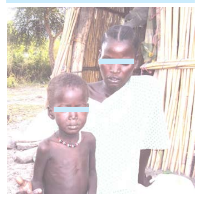
Figure 3. Patient with kala-azar seen during the 2010 outbreak at Fangar. He is visibly wasted and has an enlarged abdomen (splenomegaly).