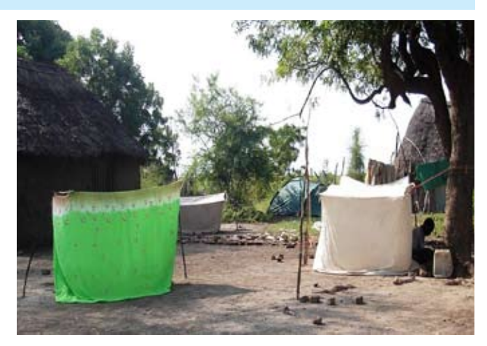
Figure 4. Types of bed nets in use (Smoking on left and Dhamoria on right).

at <a href="http://www.cdc.gov/ncidod/EID/vol11no05/04-0718.htm">http://www.cdc.gov/ncidod/EID/vol11no05/04-0718.htm</a>