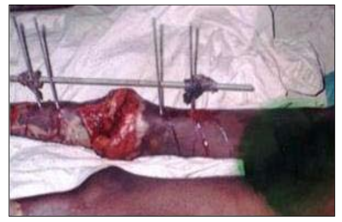
Figure 4. The improvised distraction/compression device mounted for compression

This improvisation consists of a long threaded metal rod that passes through two pieces of metal pipe. A small piece of metal plate is welded at an angle to each pipe. The angle between the pipe and the metal plate face each other when compression between fracture fragments is required. The angles face opposite directions when distraction is required. During compression of fragments a washer is placed at the each end of the bolt. This washer