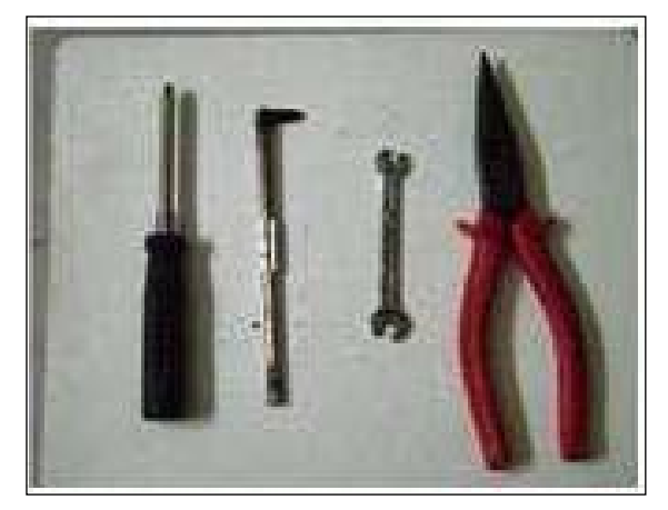
Figure 3. Tools for assembling the fixator.

before reaching it. Thus the number of revolutions per minute(r/m) is reduced from 2500r/m to 800r/m. This also reduces the heat generated by friction. The more the heat generated during drilling of holes in bones the more the necrosis along the pin tracts and the higher the possibility of pin tract infection which will cause the pins to wobble and loosen. The chuck of the powered technician's drill does no communicate with the interior of the drill. For this reason only short drilling bits can be used. Long drill bits are not suitable becausethey can break as result of the torque.