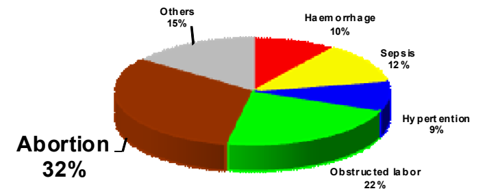
Figure 1. Share or abortion for maternal death in Ethiopia, 2003.