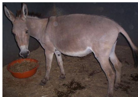
Figure 1: Typical case of tetanus

Hyperesthesia, elevated tail, flicking of the nictitating membrane on touch, extended head, stiff gait, dilated nostrils and erect immobile ears were the common clinical signs observed (figure 1). Trismus, dyspnoea and recumbency were also encountered in some animals.