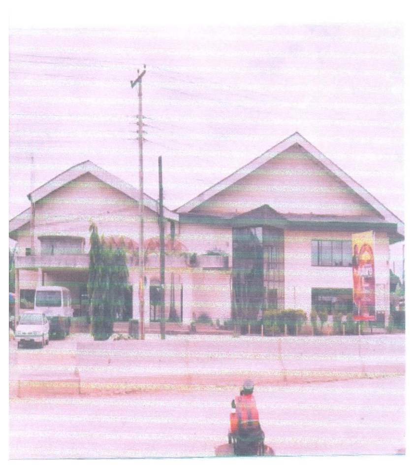
Plate 2: Power Chapel building in Offot Clan, Uyo LGA of Akwa Ibom State, Nigeria dotted with herbaceous flowers