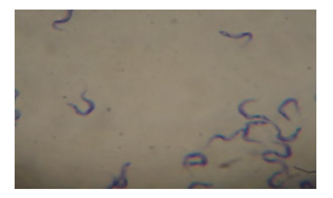
Fig. 1. Giemsa stained picture of T. brucei brucei (X4000 magnification)

The test organism used, Trypanosomabruceibrucei, was obtained from stabilates maintained at the Nigerian Institute for Trypanosomiasis Research (NITR), Kaduna, Kaduna State, Nigeria. The parasite was maintained in the laboratory by serial passage in rats. Passage into healthy rats was considered necessary when the parasitaemia was in the range of 100 and above per microscopic field (at X400 magnification).