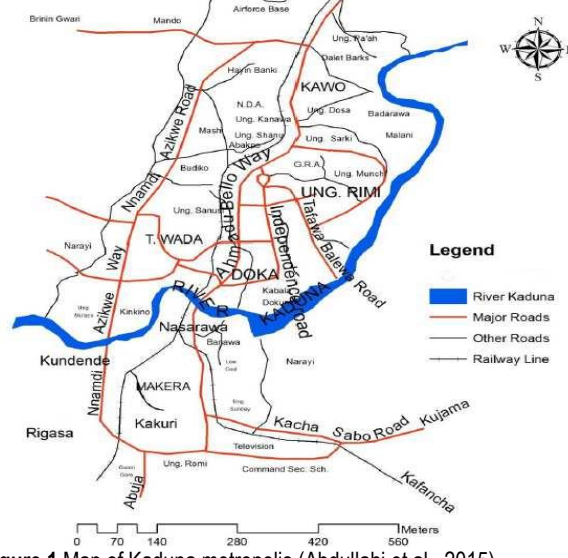
Figure 1 Map of Kaduna metropolis (Abdullahi et al., 2015).

The study area lies between latitude 10^{\circ}53^{I}0^{II}N and longitude 7^{\circ}43^{I}0^{II}E as depicted in Fig. 1 which comprises of Chikun, Kaduna North, Kaduna South and Igabi Local Government Areas of Kaduna State, Nigeria.