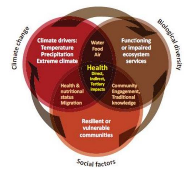
Figure 1: Interactions between climate, biodiversity and social factors

The World Health Organization recognized the links between ecosystem health, human health and climate change (as shown in Figure 1) and concluded that "climatic change instils a substantial and emergent danger to public health." Therefore, those at risk and our surrounding population need to be protected as they bear the brunt of ecosystem changes and the influences of climatic change.