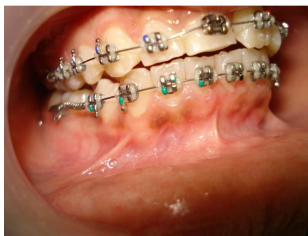
Figure 4: Crown of the upper left central incisor fully exposed and well aligned on the arch

Successful removal of the impeding odontoma followed by orthodontic management of an impacted incisor with a fixed appliance could successfully restore the child's aesthetics and self esteem.