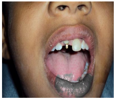
Fig 2f: Case No. 2 during a second course of treatment

A longer, thinner, gold plated screw post (1-long) was inserted to reach approximately 1/3 of the root length.