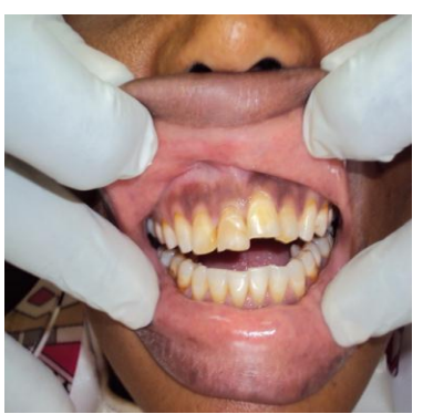
Fig 3a: Case No 3 before treatment

On dental examination, she was found to have dental fluorosis with intrinsic stains of all the teeth at varying degrees. She also had a malocclusion due to labially displaced and slightly intruded tooth 21 due to trauma at her early age. Tooth 22 was slightly displaced palatally due to an accident. The upper teeth were more discolored than the lower teeth.