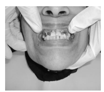
Fig. 1a: Case No. 1 before treatment.

An old female patient presented with rampant caries, mostly affecting the upper teeth.