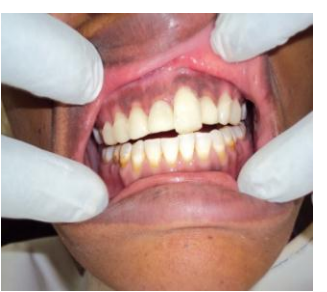
Fig 3c: Case No 3 during the course of treatment

Under Local Anaesthesia, veneering and restoration / correction of upper anterior teeth (14 - 24) were done on several visits.