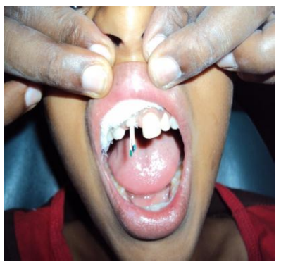
Fig 2e: Case No 2 during a second course of treatment

Root canal treatment was therefore repeated.