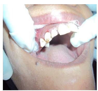
Fig 1c: Case No 1 during treatment

Composite crowns were then built up and all other carious teeth were restored.