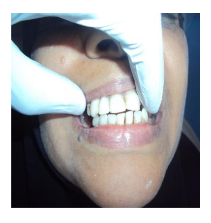
Fig 1d: Case No. 1 after completion of treatment

Composite crowns were then built up and all other carious teeth were restored.