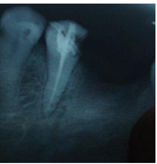
Fig.5 Post-treatment periapical radiograph for tooth number 35