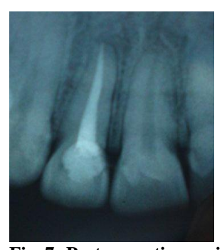
Fig. 7 Post-operative periapical radiograph of tooth number 22

No drainage was observed during the procedure; thus, the canal was thoroughly cleaned, disinfected and the access cavity was sealed with a temporary filling. The patient was cautioned of post-operative pain, and antibiotics and analgesics were prescribed. Lastly, the patient was appointed for second visit after two weeks to finalize her treatment. At a revisit, two weeks later, the patient reported that she had mild pain for the first two to three days which were taken care by the prescribed medication. Otherwise, the swelling had subsided in three days. Further debridement and canal preparation continued without application of local anaesthesia. Obturation and coronal seal was done and post-operative radiograph taken as is observed (Fig. 10).